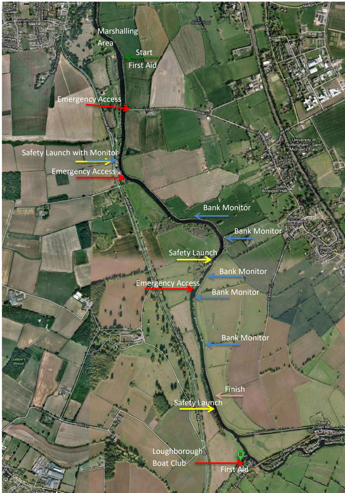
Loughborough Head of the Soar